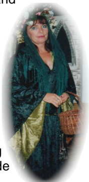
Elaborate costumes are a trademark of Upstage