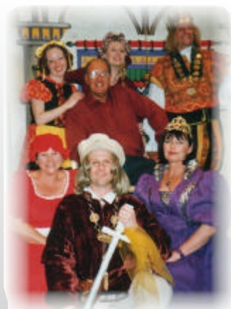
Upstaged by costumes! Page 5